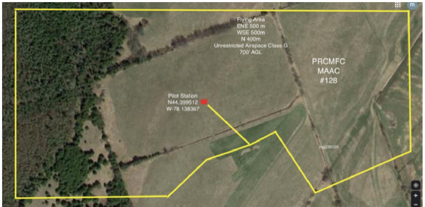
Figure 2 - Google Map of the PRCMFC FLYING AREA