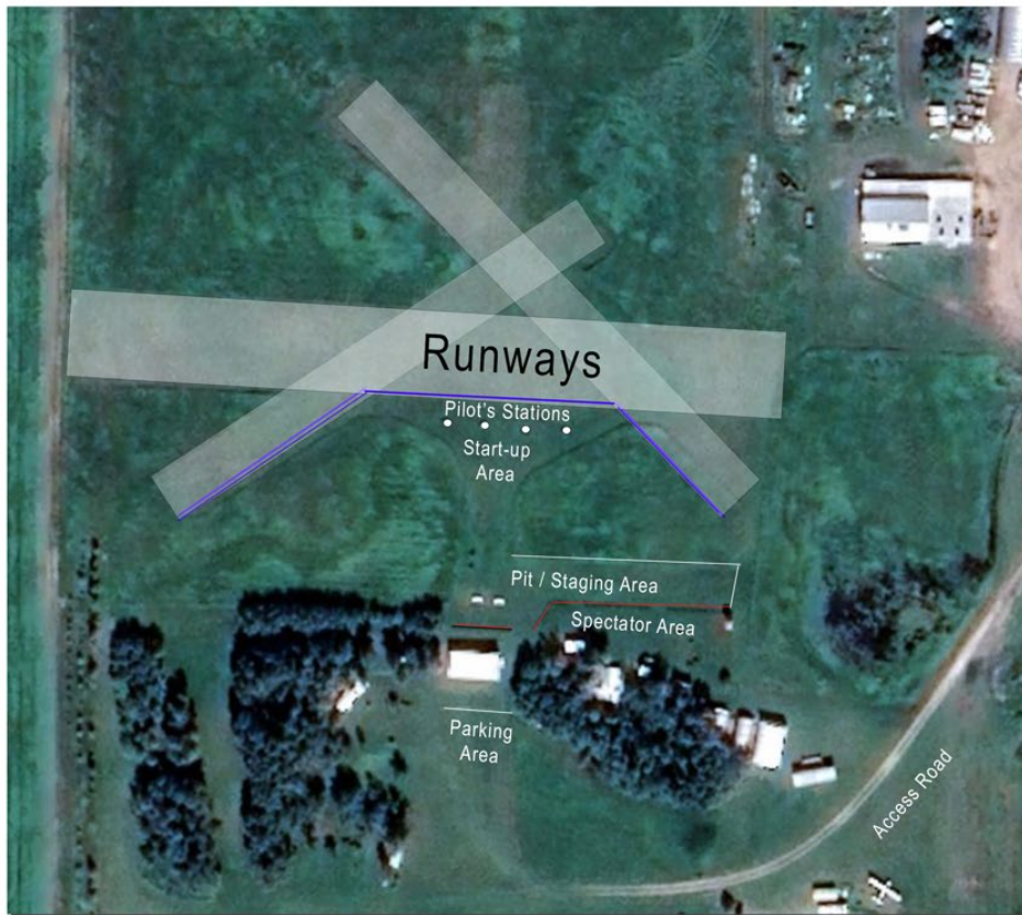
Camrose Modelers Association Alberta's Littlest Airport Field Layout