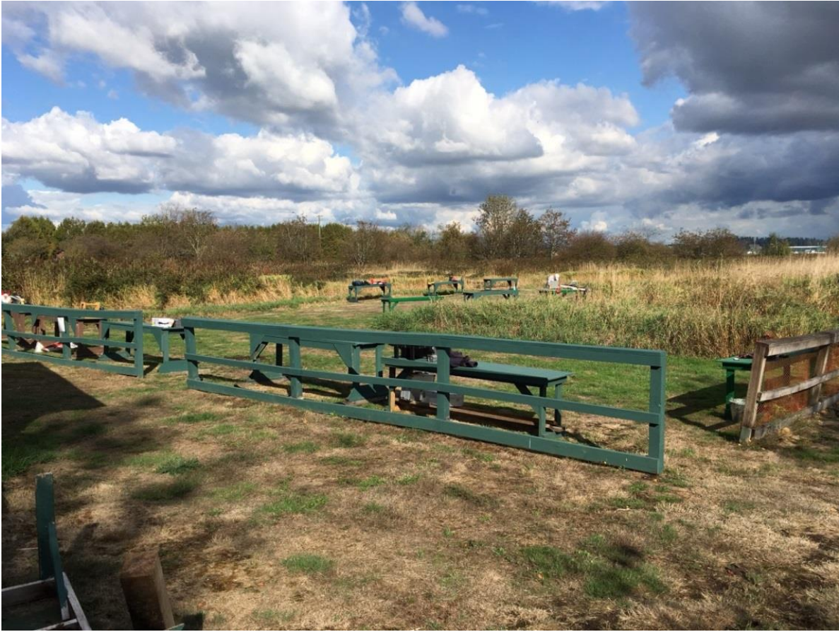
The following image shows the walkway between the Pit table and runway areas: